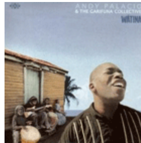
CD: Andy Palacio & the Garifuna Collective

We're used to the idea that the best musicians and producers working today tend to take an everything-but-the-kitchen-sink approach to mixing genres. But the songs on the glorious new CD Wátina represent a musical mash-up that's indigenous and historic rather than forced five minutes ago in an American recording studio.